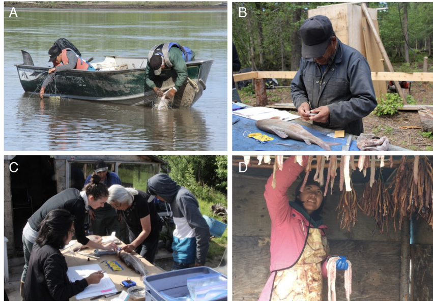
Fig. 5. Whitefish are harvested in gillnets (A) and sampled (B and C) before being frozen or smoked and dried for consumption (D).

whitefish prior to 2005 (VanGerwen-Toyne et al. 2008; Harris et al. 2012; Millar et al. 2013), but relatively few efforts have focused consistently on this species and the GRRB has therefore highlighted an outstanding need for baseline data.