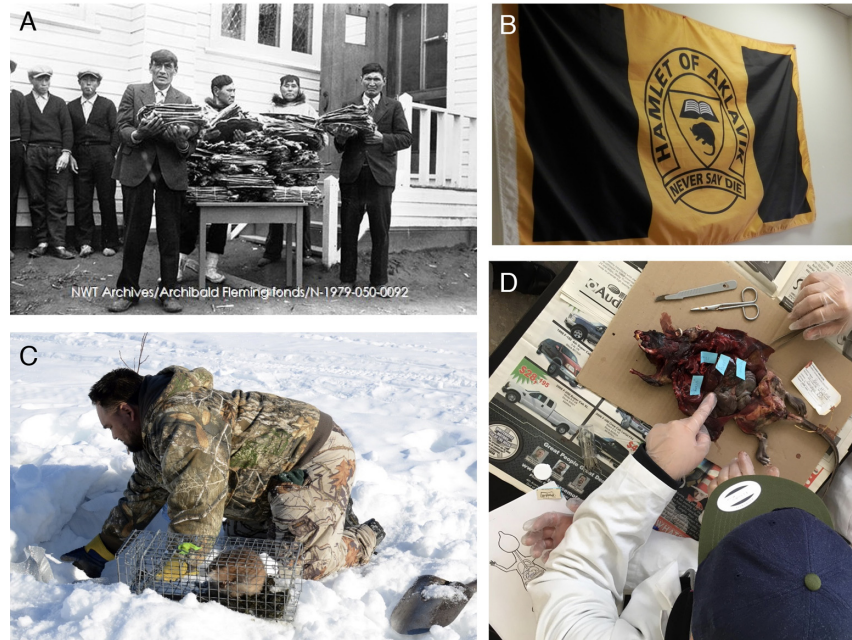
Fig. 4. (A) Rat Sunday collection in Aklavik 1933 (Northwest Territories Archives; used with permission), (B) the flag of the Hamlet of Aklavik featuring a muskrat (Farnel 2017; used with permission), (C) muskrat live trapping by community members (photo by J. Brammer, individual featured with permission), and (D) a community carcass collection project (photo by J. Brammer).

This harvest by trapping and shooting was such a cornerstone of the economic and cultural life of Gwich'in communities in the GSA that muskrat pelts were used for church collections on "Rat Sunday" (Fig. 4A), and the muskrat was included on the flag of the Hamlet of Aklavik (Fig. 4B). The underlying importance of muskrats and ridding season in Delta life was described by a young trapper living in Inuvik, "it doesn't quite feel like springtime in the Delta if you don't go out and get some rats, after a long cold winter you get out there in the spring ... it's just good for you ... Therapeutic, for Delta people" (Turner et al. 2018, p. 607).